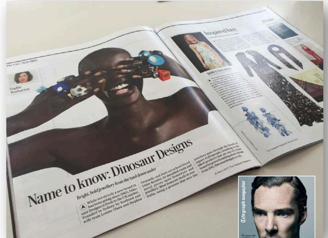
Telegraph Magazine: 26.03.17

The challenge is to continually deliver high-end, high-impact media coverage through press office activity, on a limited budget